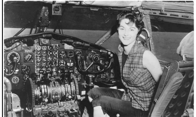
C-119's AT BAKALAR A.F.B. ARE ALL EQUIPPED WITH AUTOMATIC PILOT