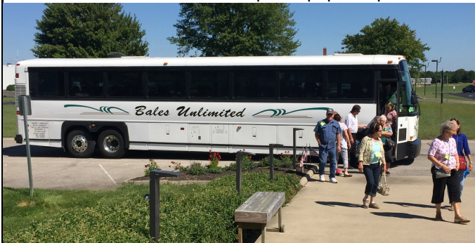
Some scheduled tour groups come by the bus load.

This scheduled tour group really enjoyed their visit. One of them liked our conference room and kicked back for a few minutes. The AC119G Gunship wall paper impressed them.