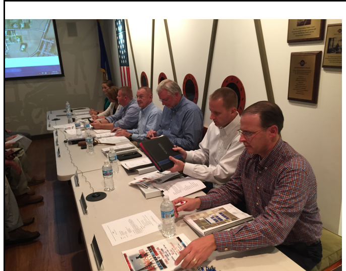
The museum was pleased to host the Columbus Municipal Airport Board of Commissioners meeting in the museum's media center with a standing room only crowd.